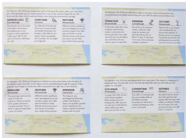
Fig. 3. A few of the 289 different oracles (postcards) Juno gives.

The variety of deities that aimed to invite visitors to explore the Roman pantheon before choosing their own, supported the tagging system that transformed the visitors’ choices into the personalised postcard.