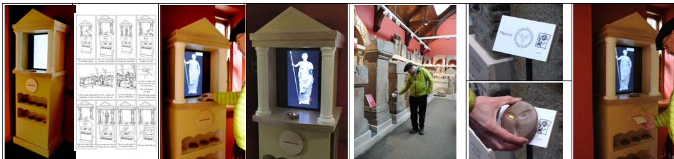
Fig. 3 My Roman Pantheon interaction steps: the shrine and the instruction panel; the lamp lit by Juno; the offering in the museum and the postcard

When the votive lamp, now empty, is placed back in the shrine, Juno reads the offering and gives back a postcard that describes the deities and how this will affect their lives on the Wall. As there are 13 deities, choosing only 3 generates 289 different combinations giving visitors the impression of