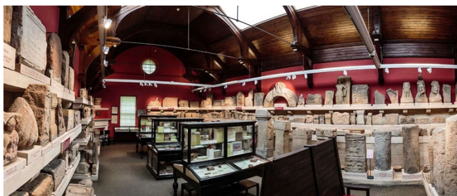
Fig. 1. The inside of the museum at Chesters Roman Fort and Museum.

The work presented in this paper revolves around The Clayton Museum, a small archaeological museum that is part of an English Heritage property, Chesters Roman Fort and The Clayton Museum, which includes the remains of a fort and bathhouse. The Roman fort at Chesters is part of Hadrian's Wall, the fortification built by the imperial army across the North of England in c. 122 AD that it is today a UNESCO World Heritage Site. The museum at Chesters was created in 1896 to host John Clayton's collection of Roman objects, mostly from Hadrian's Wall and its surroundings. John Clayton is credited with the preservation of Hadrian's Wall: his country home had the fort of Chesters in the grounds and he began excavating there in 1843. The museum, first opened in 1896 (Fig. 1), retains the late 19th-century style of display used in museums in Victorian and Edwardian times for the pleasure of its owner and the first travelling visitors.