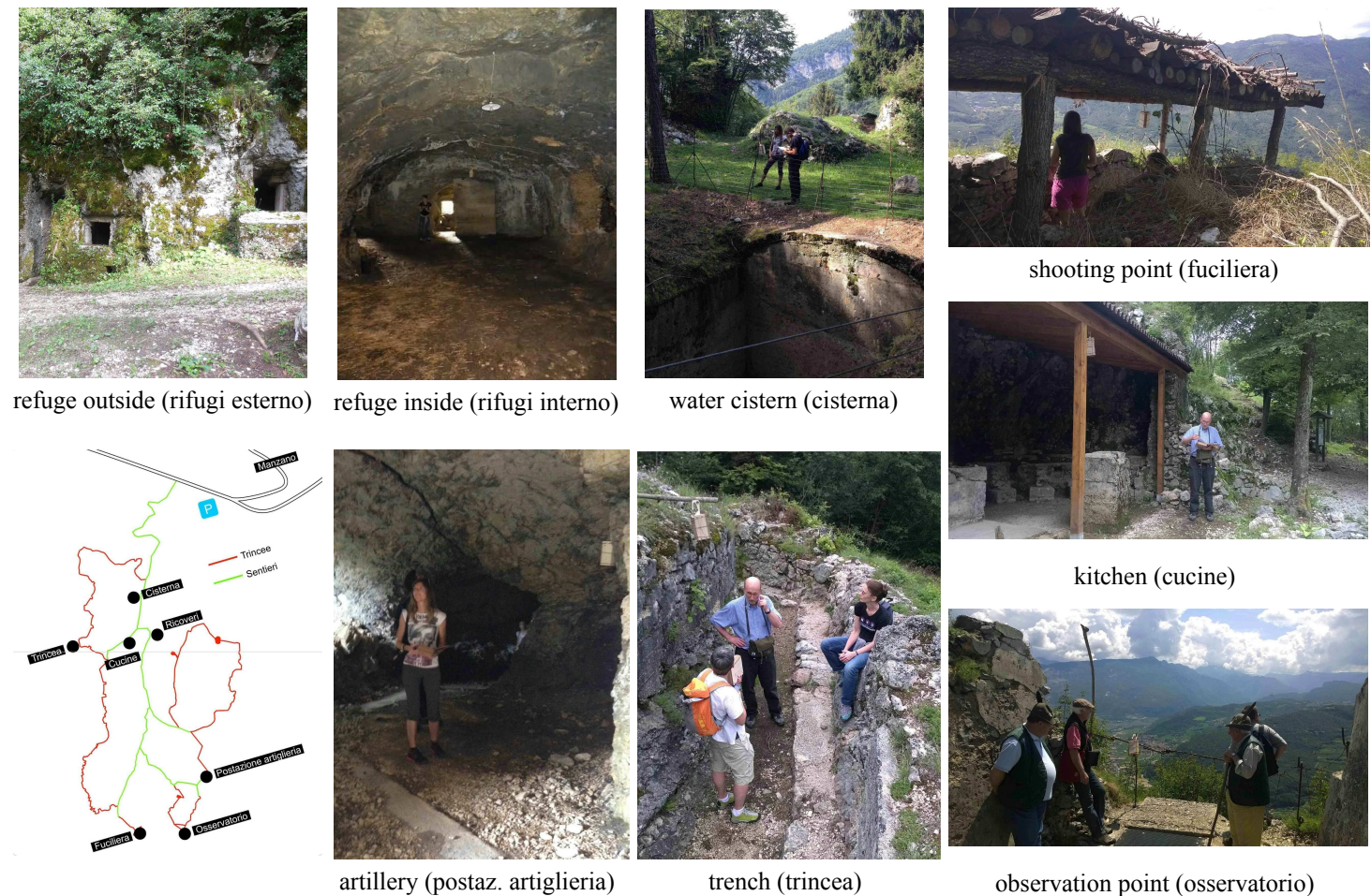
Figure 1: The narrative points and the site map. Photos taken during the trial (images of participants used with permission).

Choosing the points where the story would be told, the themes to develop across those points and the specific narrative for each point and each theme was a substantial part of the system design. Some experiments with an early prototype of the narrative in place concept had been carried out in a local heritage site (Ciolfi et al. 2013); the experience gained has been used to design the aspects related to the content and content delivery, specifically: to select points of interest located far enough apart to avoid interferences; to position the audio source above the ground (ideally above the visitors' head) for better listening; to select a variety of themes; to keep the content short (about a minute for each narrative) and to select distinct attraction sounds for each theme as reminder and cue of the theme itself.